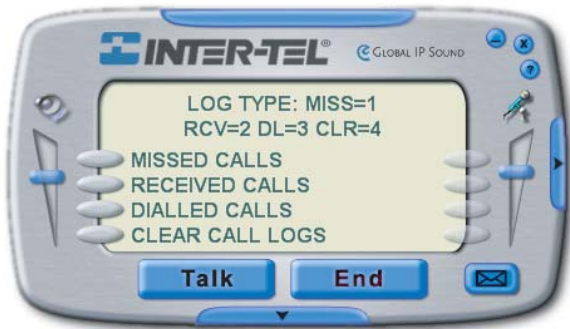
S8602 IP Softphone Feature Access

Location, location, location: Today's dynamic communications landscape requires multi-device options - from desktop phones to handheld PDAs, laptops and wireless endpoints. Inter-Tel extends its market leading applications performance to its wide range of flexible, mobile and easy to use communications endpoints. Regardless of location, the user has the same functionality and access to system features as if they were at their desk in the office.