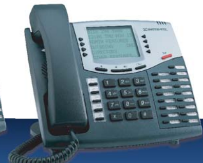
8660 IP Executive