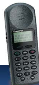
S8665 IP Industrial Wireless