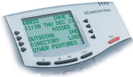
Menu access on the 8560

Versatile endpoint solutions: Inter-Tel's endpoints provide the same feature access and functionality across the full range. Whether users have a desk endpoint, a softphone running on their laptop, or a wireless endpoint, the extensive array of features provided by an Inter-Tel solution can be accessed through the same screen-based menus, feature codes and fully programmable feature buttons.