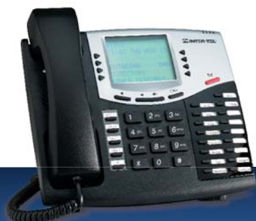
S8662 Multi-protocol Executive

Designed to provide interoperability and enhanced services, SIP connects a wide variety of multimedia endpoints and applications together in a standard format.