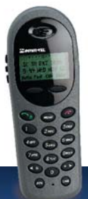
S8664 IP Office Wireless