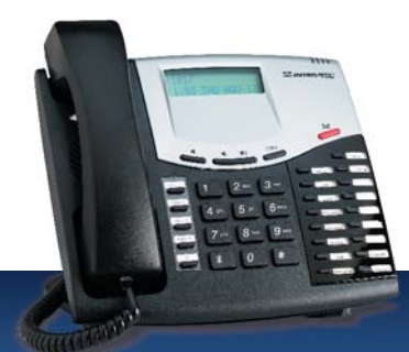
S8622 Multi-protocol Standard