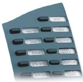
Programmable feature keys