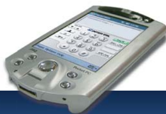
S8601 SIP PDA SoftPhone