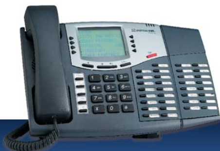
8560 Executive & 8416 Mini DSS Console

Quickly search through internal or external directories via the alphanumeric keypad. The directory will predict matches as they are typed.