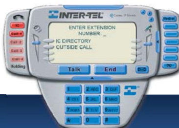
S8602 IP SoftPhone