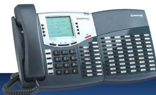
8560 Executive & 8450 DSS Console