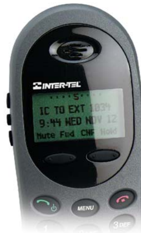
S8664 Wireless Endpoint Screen Menu Access

Also allowing users to stay connected to the enterprise while mobile is the S8601 SIP PDA Softphone. Users can access all system features via Pocket PC within a 802.11 wireless network.