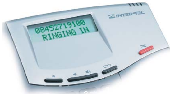
CLI presentation on the 8520